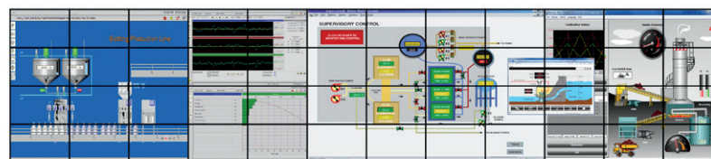
Combine with Matrox QuadHead2Go to build large-scale video walls