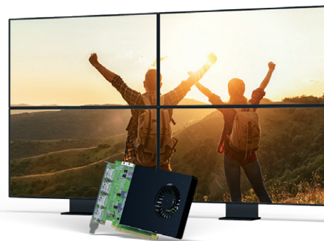
D-Series D1480 - Quad DisplayPort graphics card