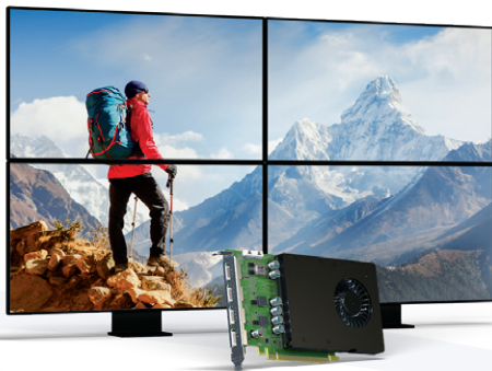
D-Series D1450 - Quad HDMI graphics card

Full-height, Gen 3 PCIe® x16 four-output graphics cards with four native HDMI® or DisplayPort™ connectors deliver the best display density, resolution, and performance for demanding multi-monitor applications.