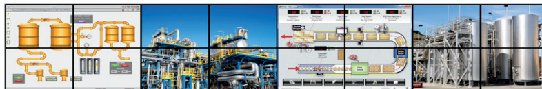
View critical information across an expansive configuration

Matrox D-Series supports numerous types of video walls and helps you create the optimal setup for every need. With a single card you can power four-monitor video walls to deliver high-impact configurations. By combining four cards, you can build larger 16-monitor video walls, or create even larger scale video walls by pairing the D-Series cards with the Matrox QuadHead2Go multi-monitor controller cards or appliances.